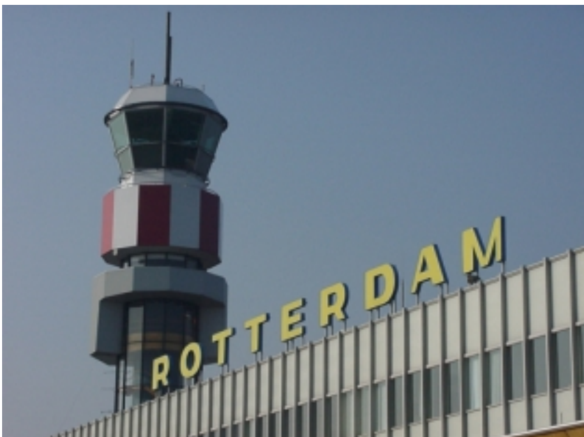
Rotterdam Airport ATC Tower

The most important airlines using Rotterdam Airport are Transavia with both charter and scheduled (Basiq Air) operations, and VLM Airlines a Belgium based company with an own station at the airport. VLM operates seven daily flights between Rotterdam Airport and London City Airport. The airline also serves Hamburg, Guernsey, Jersey, Manchester, and Liverpool via London from Rotterdam Airport. Flights to London Heathrow (KLM Cityhopper) and Graz (Welcome Air) are also available from the airport.