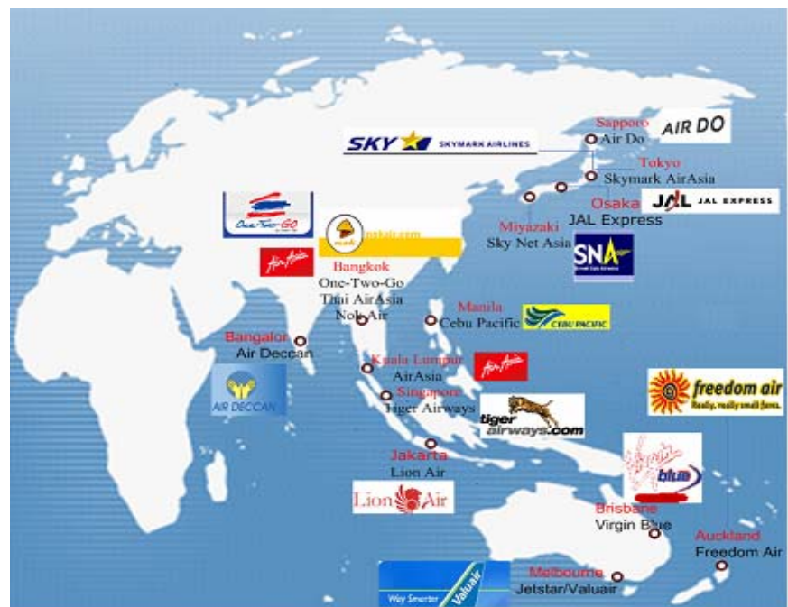
Figure 1 Geographical distribution of Asian LCCs

With respect to the geographical environment, Asian countries are quite disparately situated from one another, particularly the countries and islands